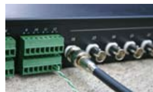
16 Port Active Hub