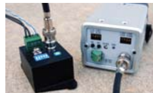
Camera to Active Transmitter