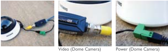
Video (Dome Camera)

* Please note that no surge suppression component can protect against all transient voltage spikes.